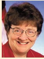
* Ellen Polimeni Vice President Mayor, City of Canandaigua